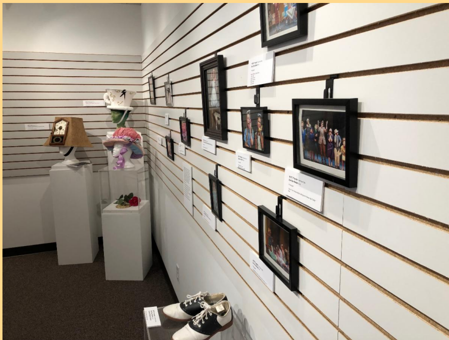
More Drama Please! Featuring items from the Thief River Falls Area Community Theater, Fosston Community Theater, and the Middle River Community Theatre.

There's still time to see our exhibit -- More Drama Please! is open now